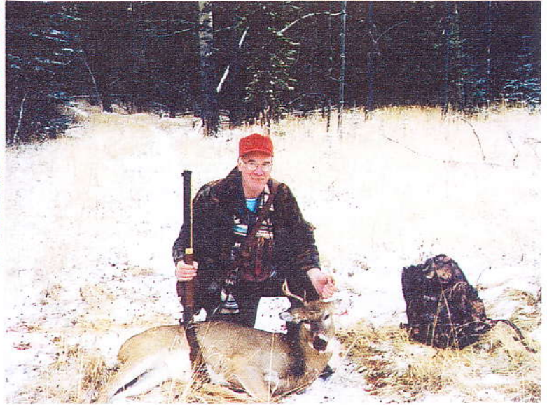
Deer steaks are a bonus (Lucky shot ??)