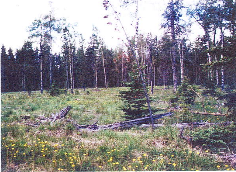
Natural regeneration didn't happen