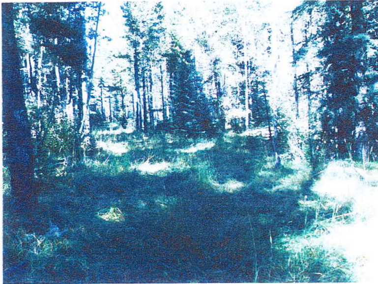
Skid and Recreation Trail