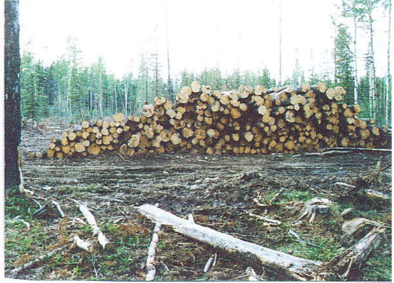
Pine deck @ $65.00 a tonne