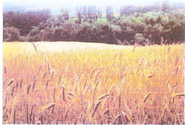
A wheat field in Upper Austria ripens under a summer sun

Just since 1990, about 170 million acres of forest have been lost, mainly in developing countries, according to a new study led by researchers with the University of Guelph ( http://www.uoguelph.ca/ ).