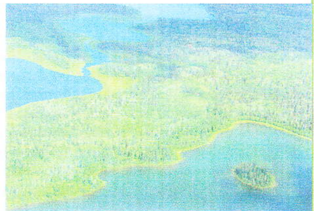
Aspen defoliation near Calling Lake.