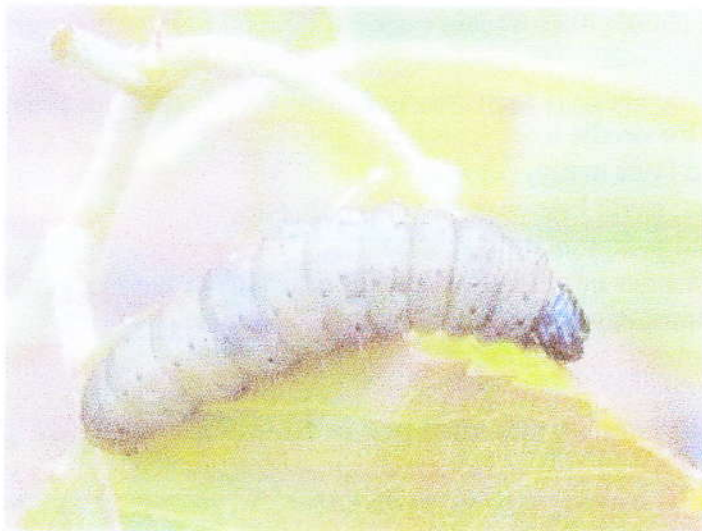
A major defoliator of poplars, large aspen tortrix larva (caterpillar) crawling on a leaf

Because woodlots require long-term management, it is important to understand that forests go through a cycle of change over time. Mammals, birds, insects, diseases, weather, and fire that weaken or kill individual trees are natural parts of forests that help with this change. A healthy forest is able to recover after a natural event like fire or insects, is able to support a variety of plants and animals and is resistant to extreme change like weather. However when there is a lack of balance and the overall health of the trees are threatened, this could be a sign of an unhealthy forest.