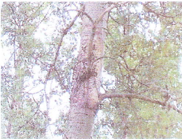
Hypoxylon canker found on the stem of an aspen poplar

Also, you can look in the image gallery to compare pictures to your observed damage for a quick, visual identification.