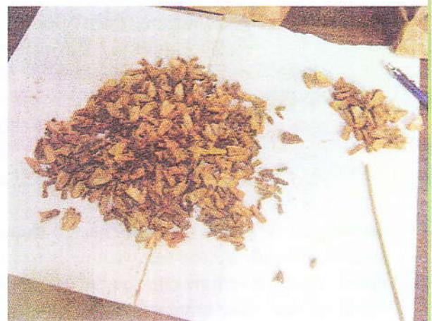
Engargia and spruce budworm trap catch.