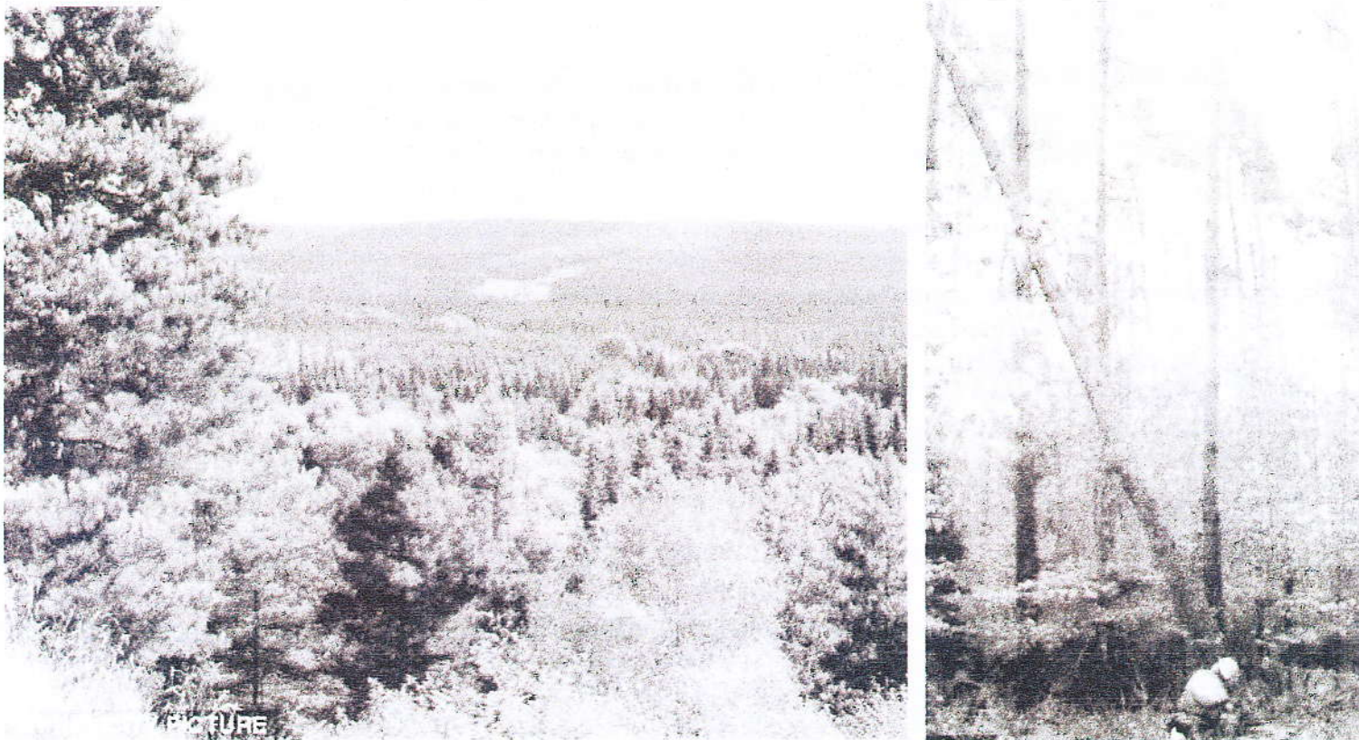
Nearly 50,000 native larch trees are being axed in the Forest of Dean in Gloucestershire

A few weeks ago came the news that nearly 50,000 native larch trees in the beautiful Forest of Dean, Gloucestershire, are being axed because they are stricken with a disease brought in from abroad.