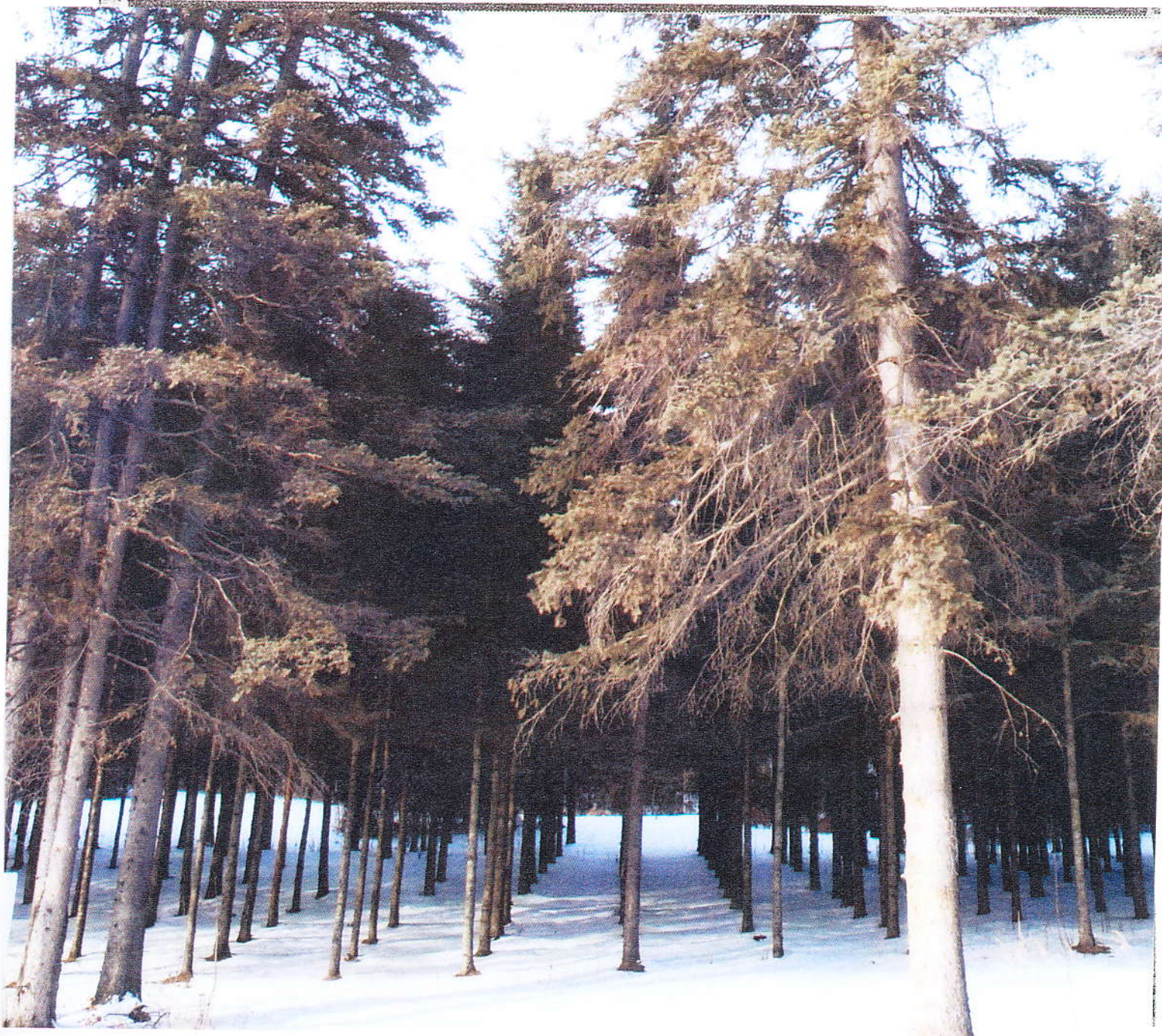
Thirty-eight year old white spruce plantation pruned to 8 ft